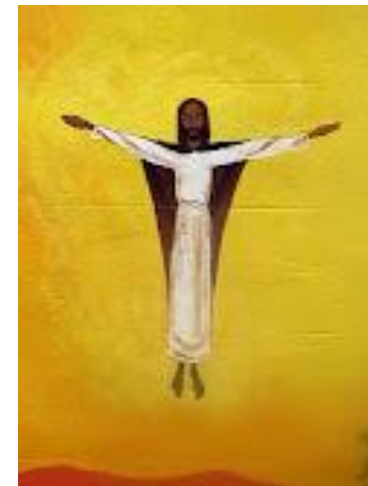
Mural of Christ ascending to heaven on a graffiti wall in Bristol, UK.